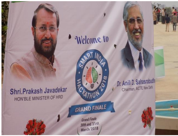
Logo for Smart India Hackathon 2018