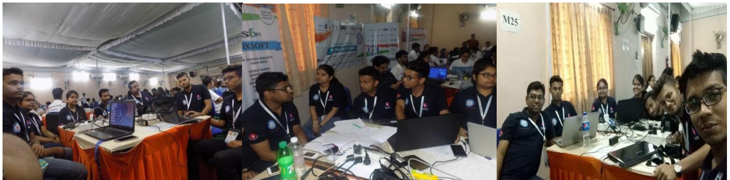
Our team "SIXSOFT" from Computer Science & Engineering department, Techno India Batanagar participated in Smart India Hackathon (SIH) 2018 - Grand Finale at Hyderabad.