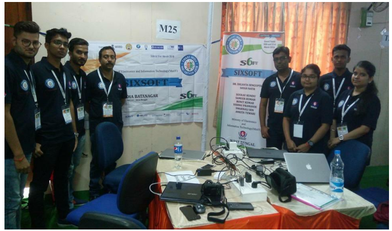
Our Vibrant Participants of Smart India Hackathon, 2018